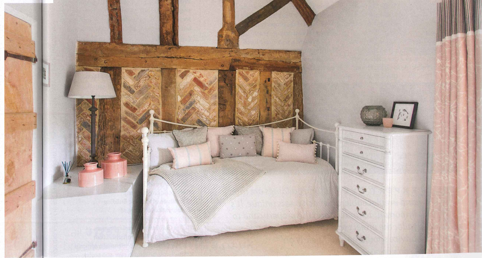
GUEST BEDROOM The soft colour palette chosen for this space enhances the old brickwork. Romo and Ian Mankin cushions, £50 each; throw, £45, all Country Knole Interiors. Curtains in Acacia, £42m, Romo