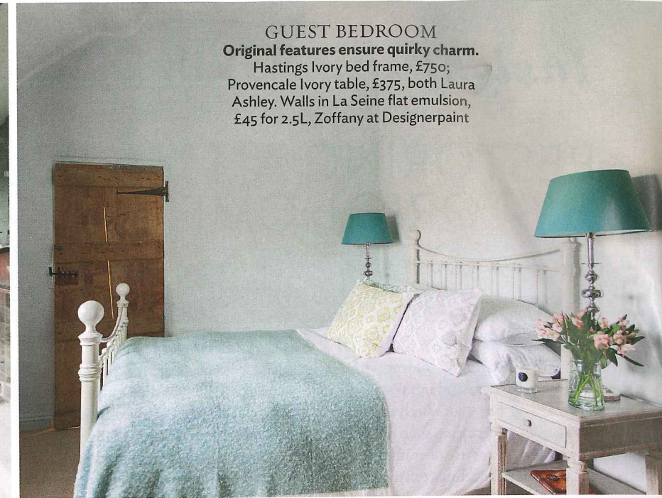
GUEST BEDROOM Original features ensure quirky charm. Hastings Ivory bed frame, £750; Provencale Ivory table, £375, both Laura Ashley. Walls in La Seine flat emulsion, £45 for 2.5L, Zoffany at Designerpaint

INSPIRATION 'I spend a lot of time browsing interiors magazines for ideas, which I then bring to life by creating boards on Pinterest'