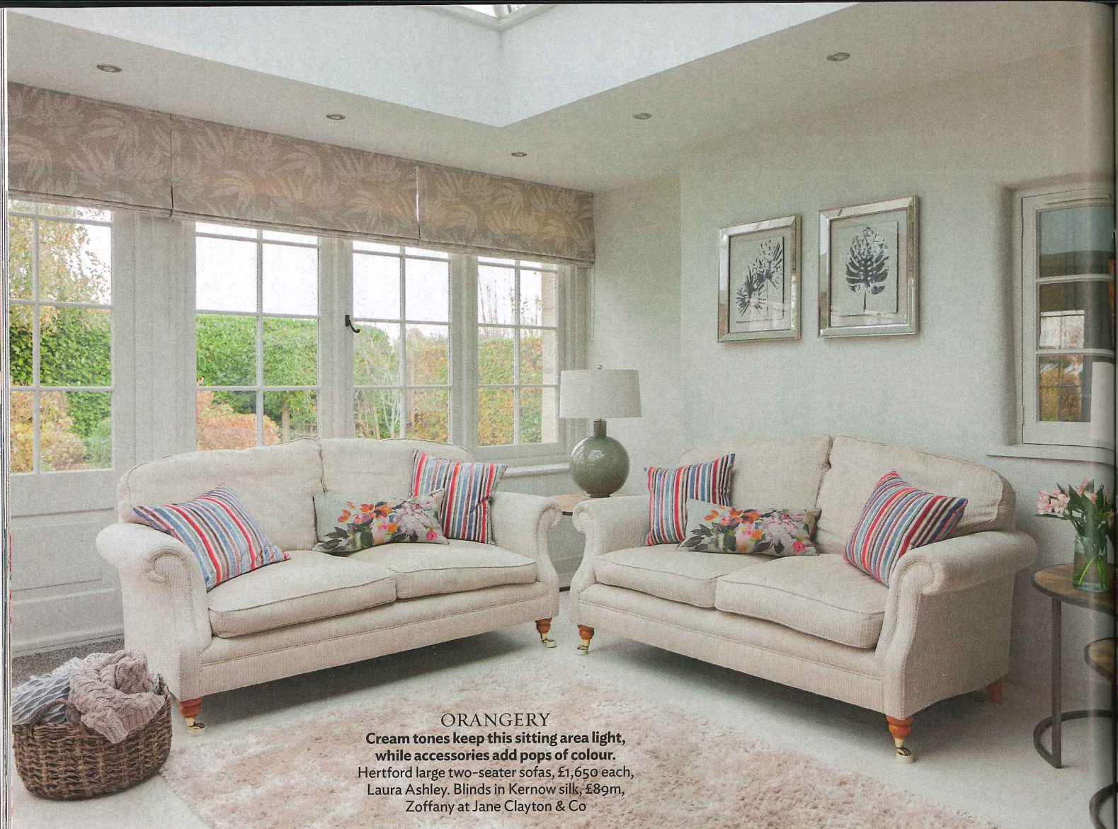
ORANGERY Cream tones keep this sitting area light, while accessories add pops of colour. Hertford large two-seater sofas, £1,650 each, Laura Ashley. Blinds in Kernow silk, £89m, Zoffany at Jane Clayton & Co