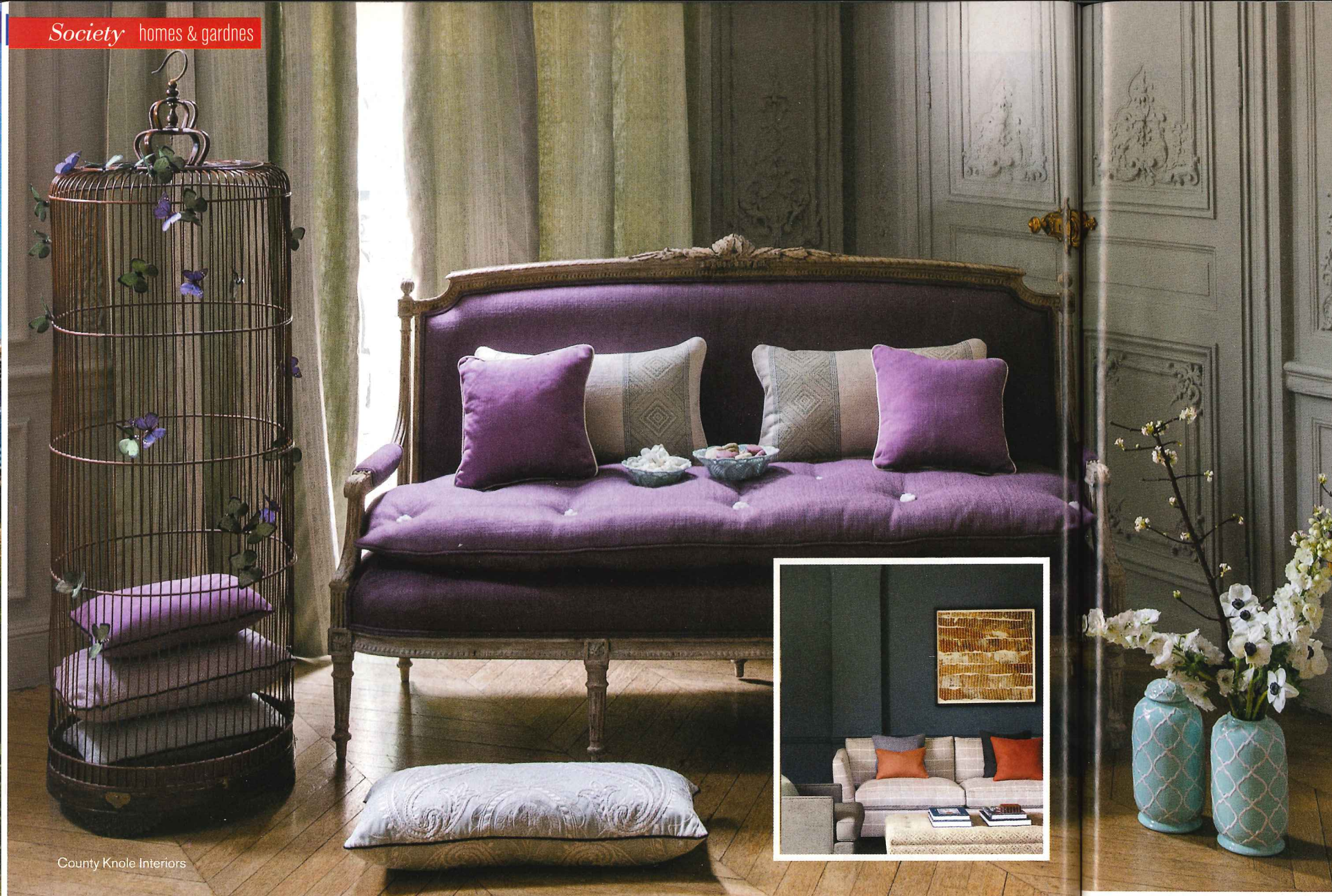
Country Knole Interiors